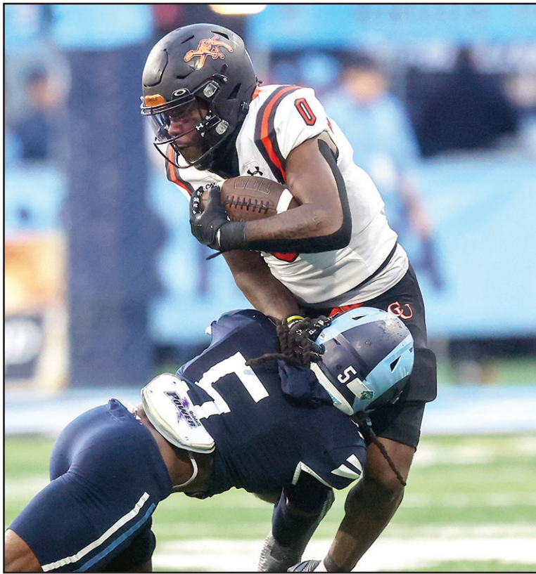
THE GREAT RANDALL KING IN ACTION