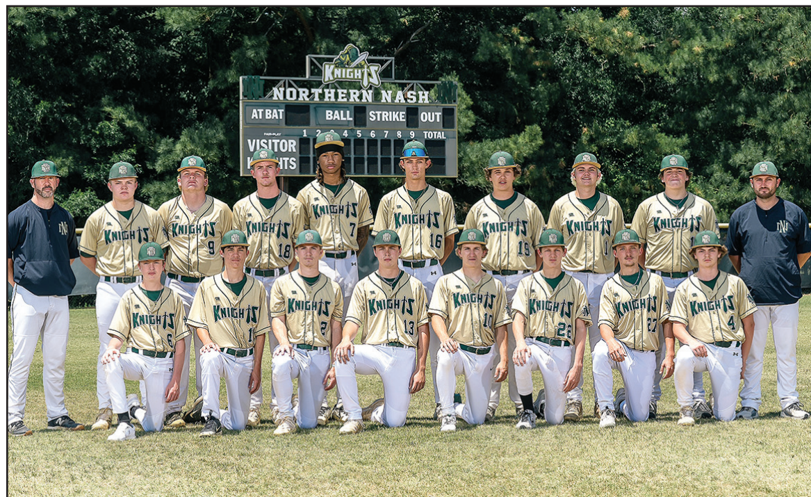
2026 NORTHERN NASH HIGH SCHOOL BASEBALL TEAM