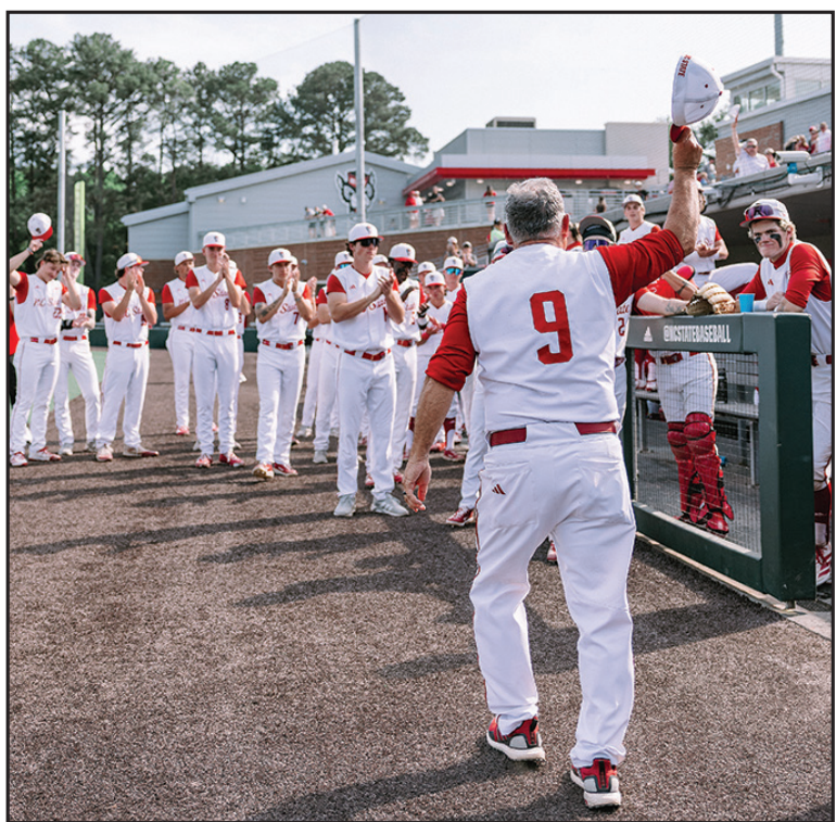
THE GREAT NUMBER NINE WAVES GOODBYE