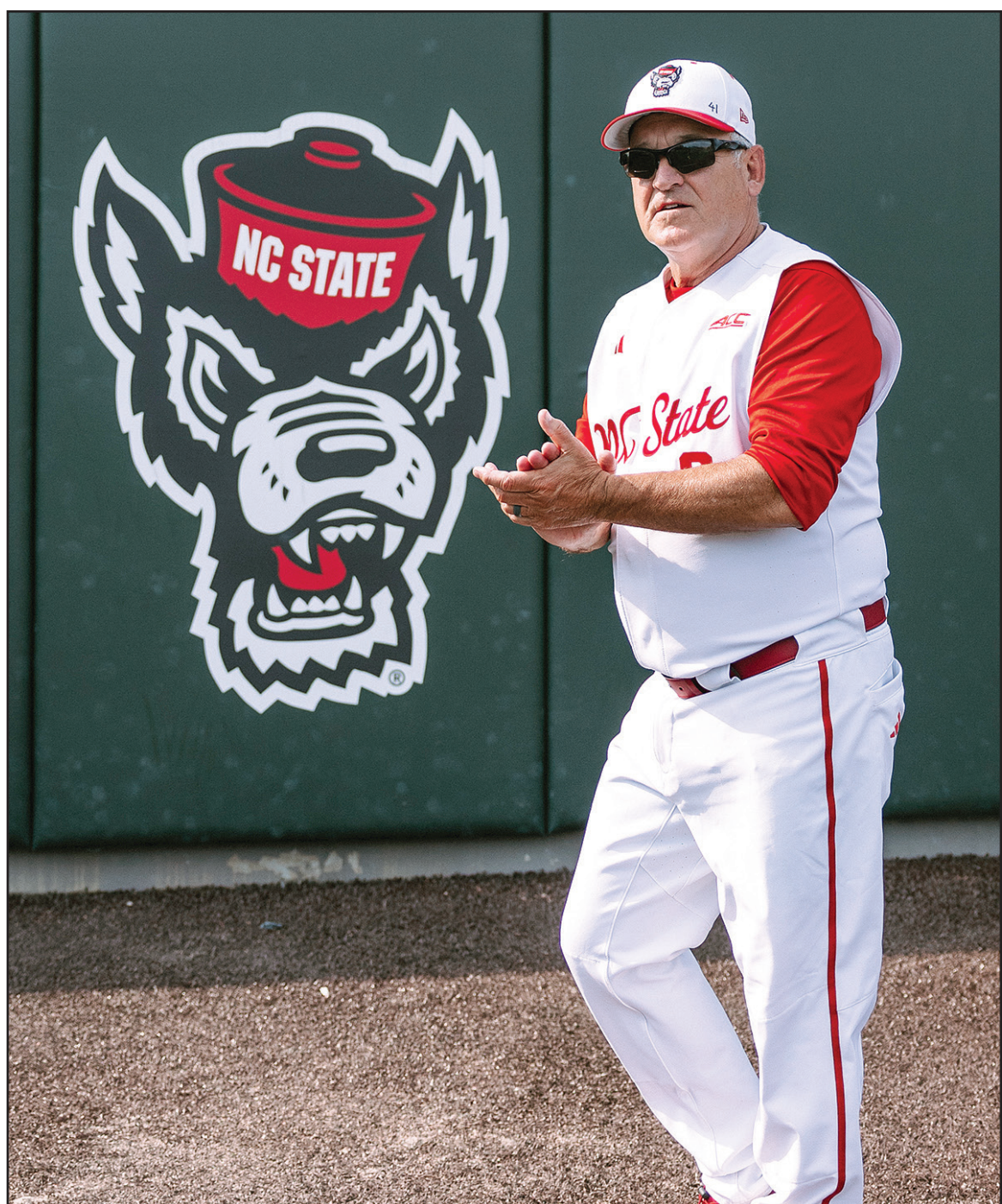
COACH ELLIOTT AVENT -- A NASH COUNTY LEGEND AND BEYOND