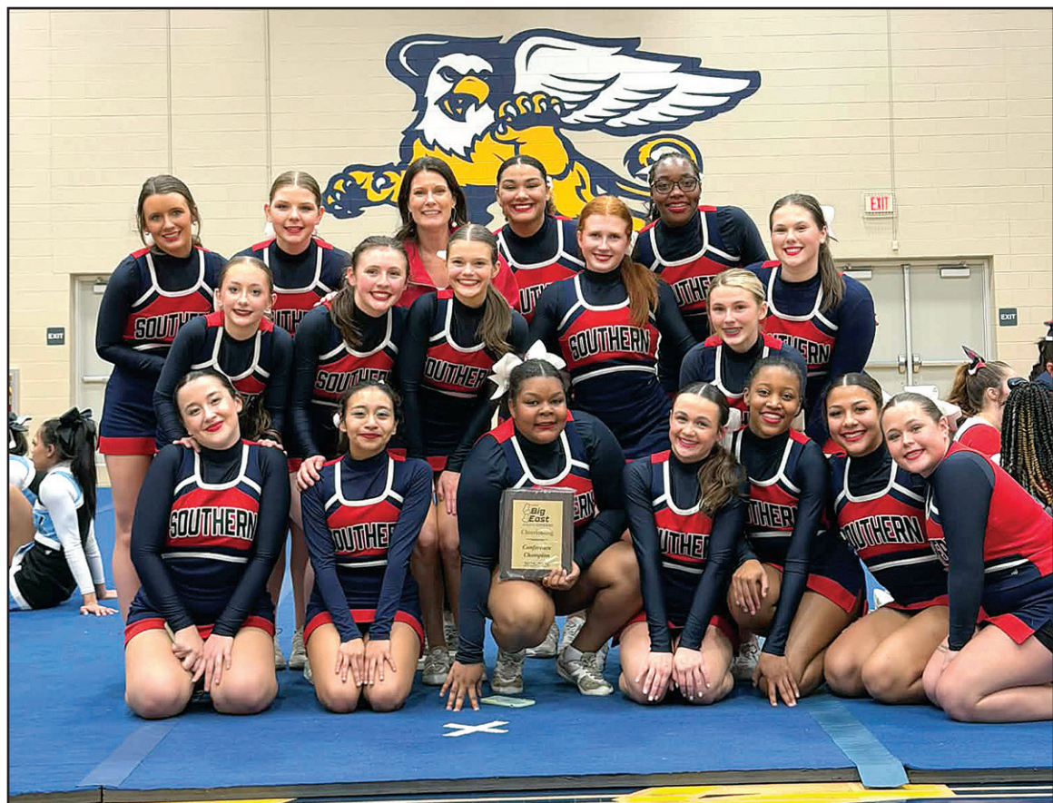
2025-26 SOUTHERN NASH HIGH SCHOOL CHEER SQUAD