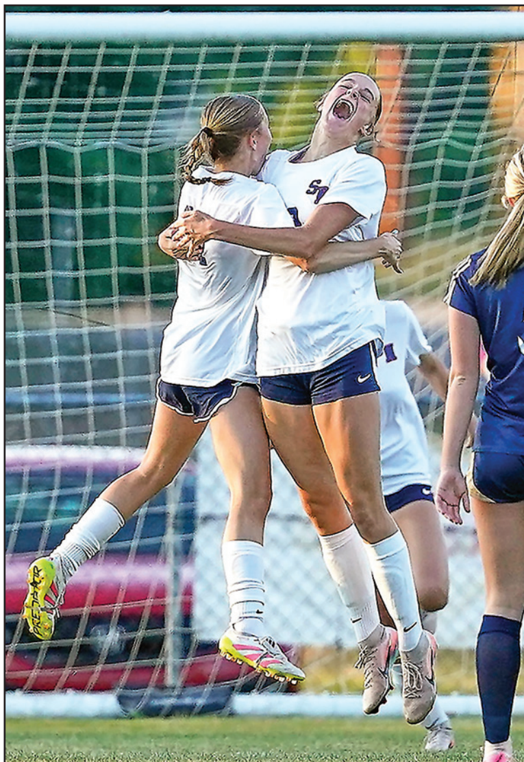
THE SOUTHERN NASH LADYBIRDS HAD PLENTY OF REASONS TO CELEBRATE THIS SPRING