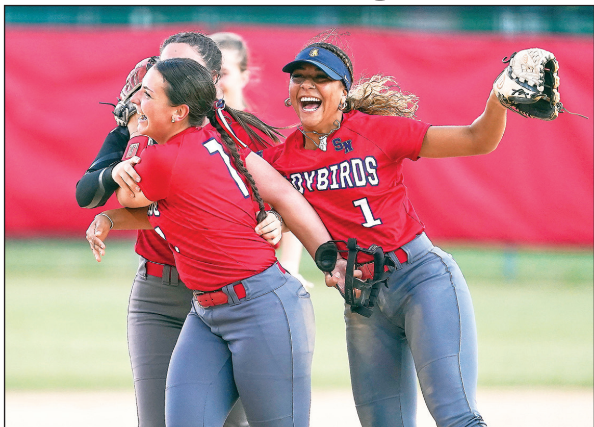
THE LADYBIRDS CELEBRATE A GREAT DEFENSIVE PLAY IN THE PLAYOFFS

Birds boasted another deep playoff surge