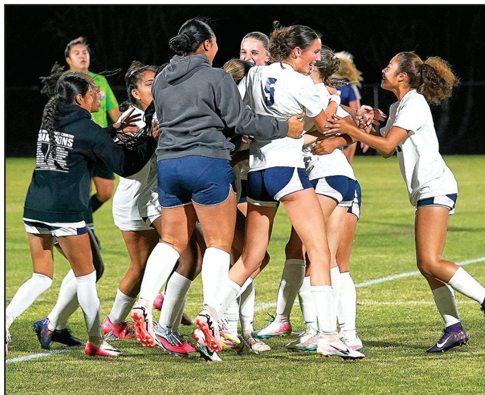
THE LADYBIRDS CELEBRATE THE HUGE VICTORY AT FIKE

It's been a long, long time since Southern Nash has advanced beyond the second round in the state baseball playoffs, but with a hoard of returning talent making its way back to the field this time next year, the Firebirds are primed for what could be one of the best seasons in school history next spring.