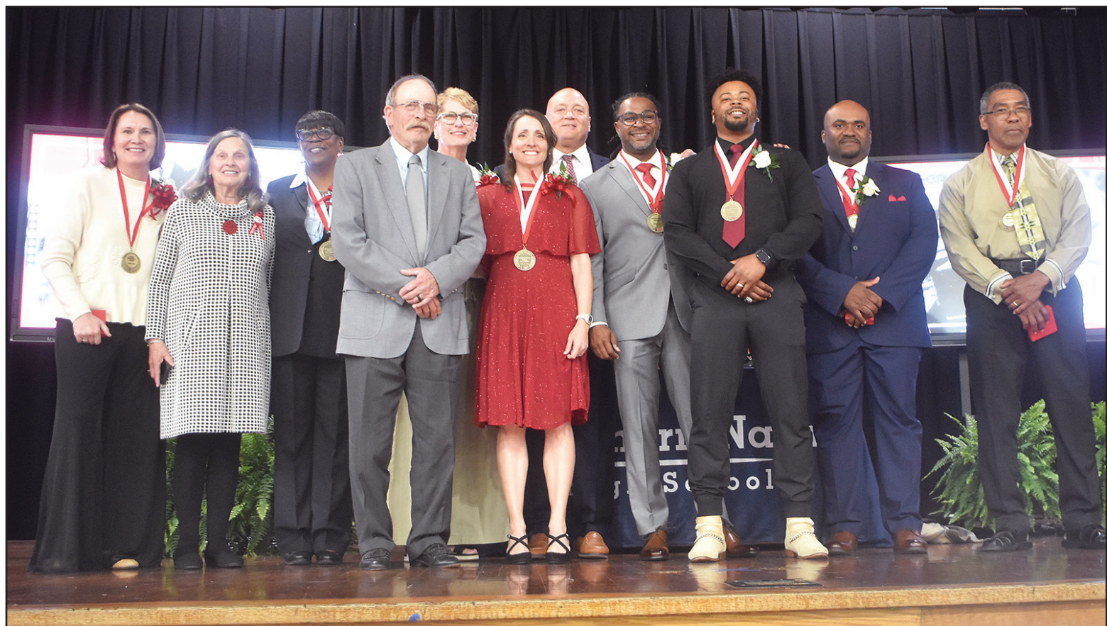
SOUTHERN NASH HIGH SCHOOL'S 2026 ATHLETICS HALL OF FAME INDUCTION CLASS