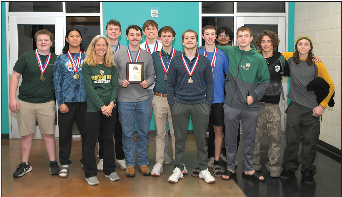
NORTHERN NASH BOYS SWIM TEAM 2025-26 BIG EAST CONFERENCE CHAMPS

Knights pick up 3rd consecutive Big East crown