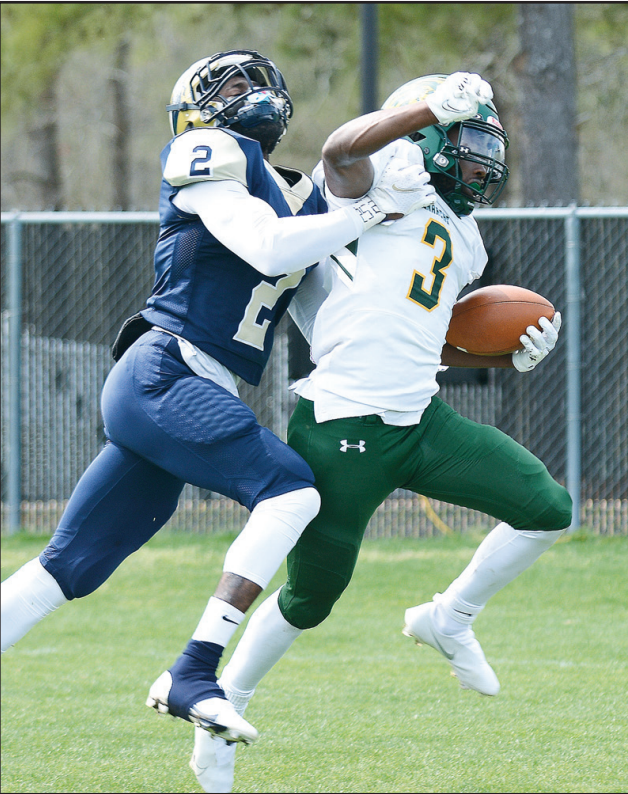
NORTH CAROLINA WESLEYAN REGISTERS A SAFETY DURING 2021 SEASON