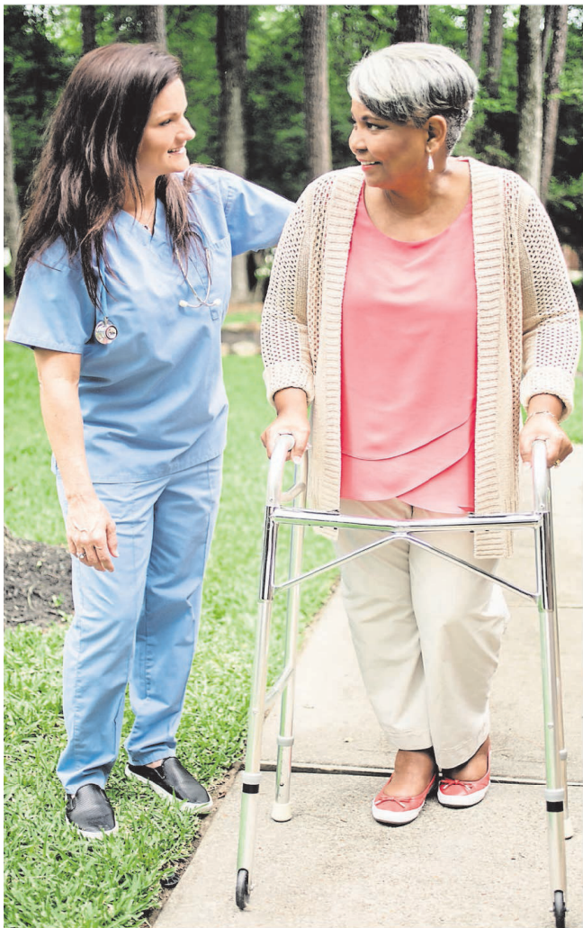
A Passion for Compassion

AHHC employs quality caregivers to assist individuals and families in their homes.