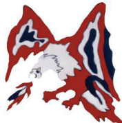
Southern Nash High School Firebirds