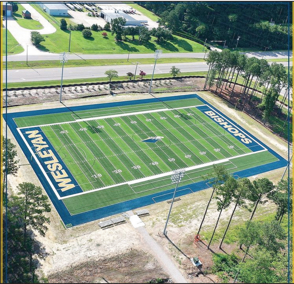
NORTH CAROLINA WESLEYAN'S NEW ON-CAMPUS FACILITY DON STALLINGS FIELD AT VERNON T. BRADLEY JR. STADIUM