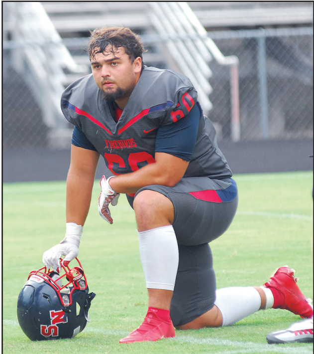
SOUTHERN NASH'S DUSTY HALL