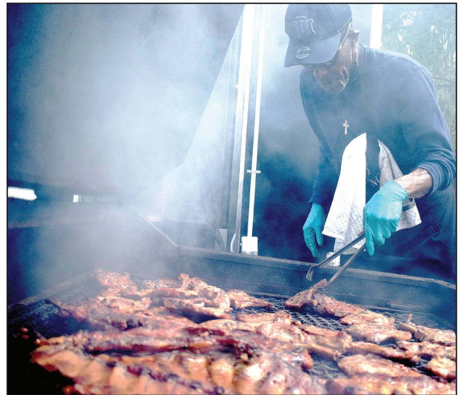
2023 Eastern Carolina BBQ Throwdown comes to downtown Rocky Mount on Oct. 13-14. Graphic file photo