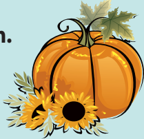
THE MONITORS October 7 10 a.m. - 1 p.m.