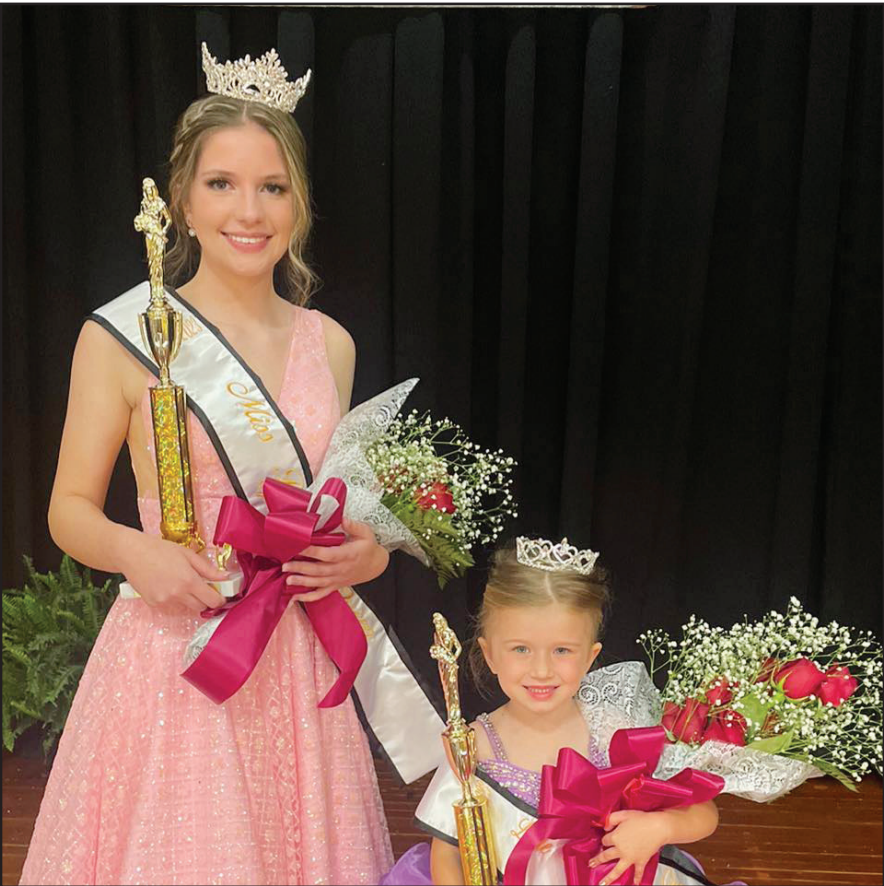
Spring Hope's 2022 queens will reign over the this year's festival.