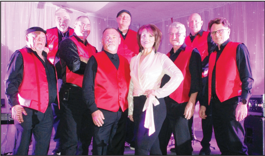
East Coast Rhythm & Blues Band ~ October 6 • 7-10 p.m.