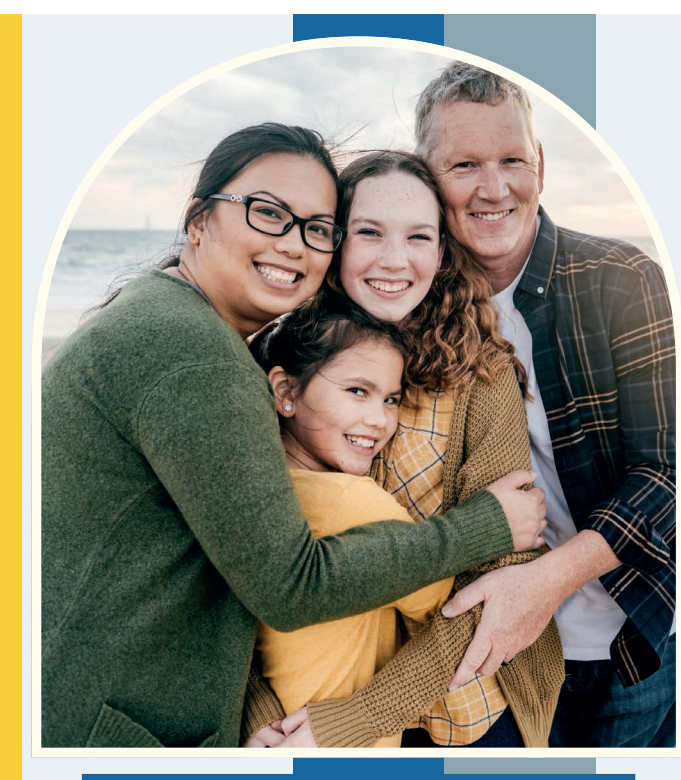
Talk to your child's doctor about HPV vaccination. Learn more at www.cdc.gov/hpv